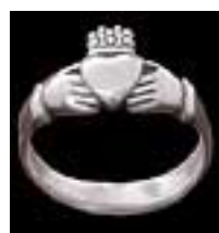
(Item No. 101)