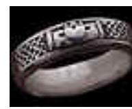
Claddagh Band (Item No.104)