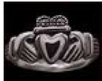
Large (Item No. 102)