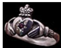
Claddagh with Stone Medium (Item No. 100S)