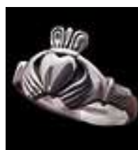
Mellenium (Item No. 103)